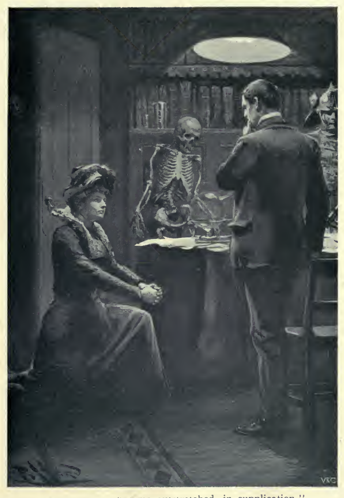
one aneit, with arms outstretched, in supplication."